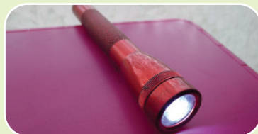
Torch & batteries