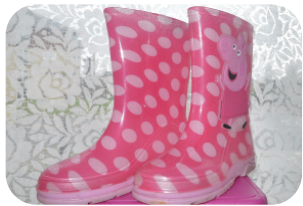
Waterproof clothing & boots