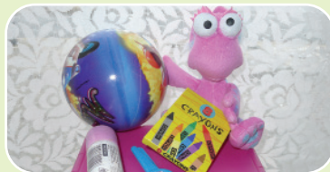
Toys & games