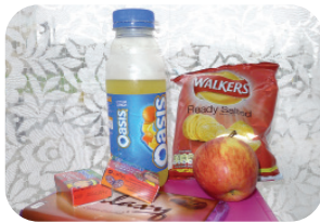
Food / energy bars