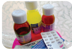
Medication / prescriptions